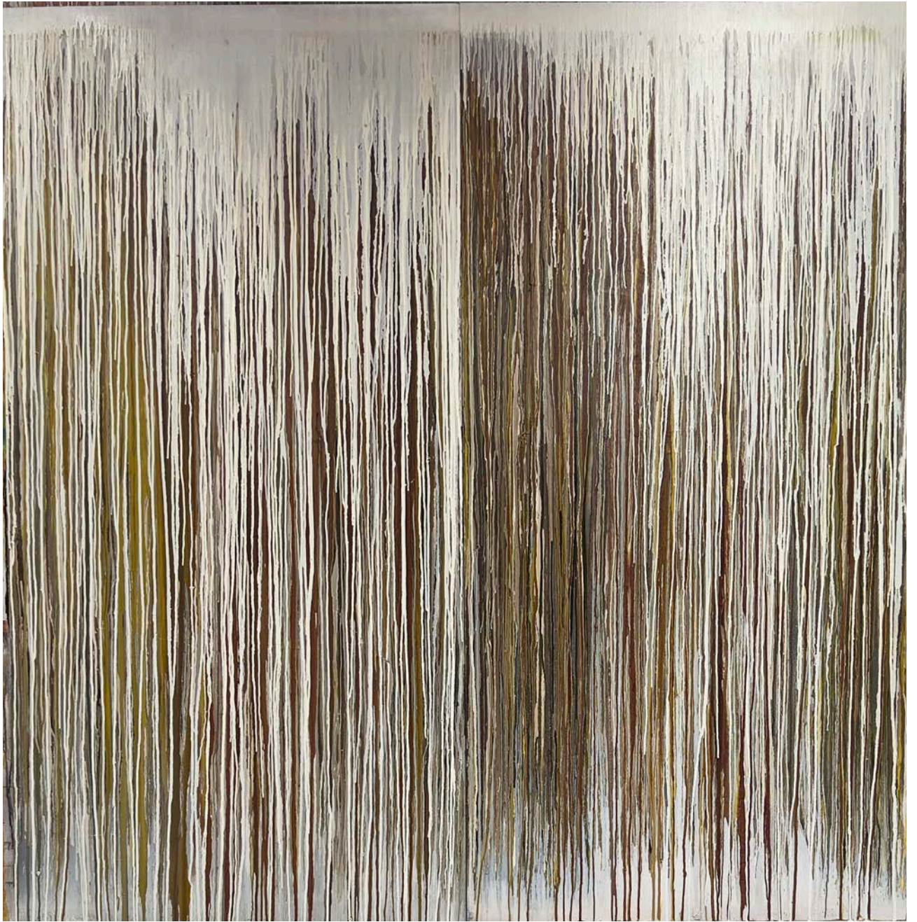
Dissolve 4, 2024 oil on wooden panel 182 x 182cm