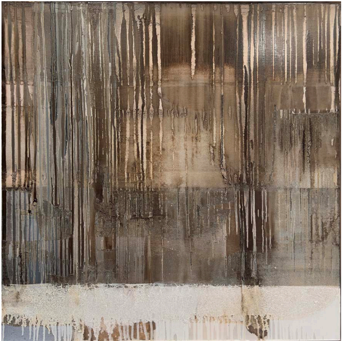
Liquid reACTION 2, 2024