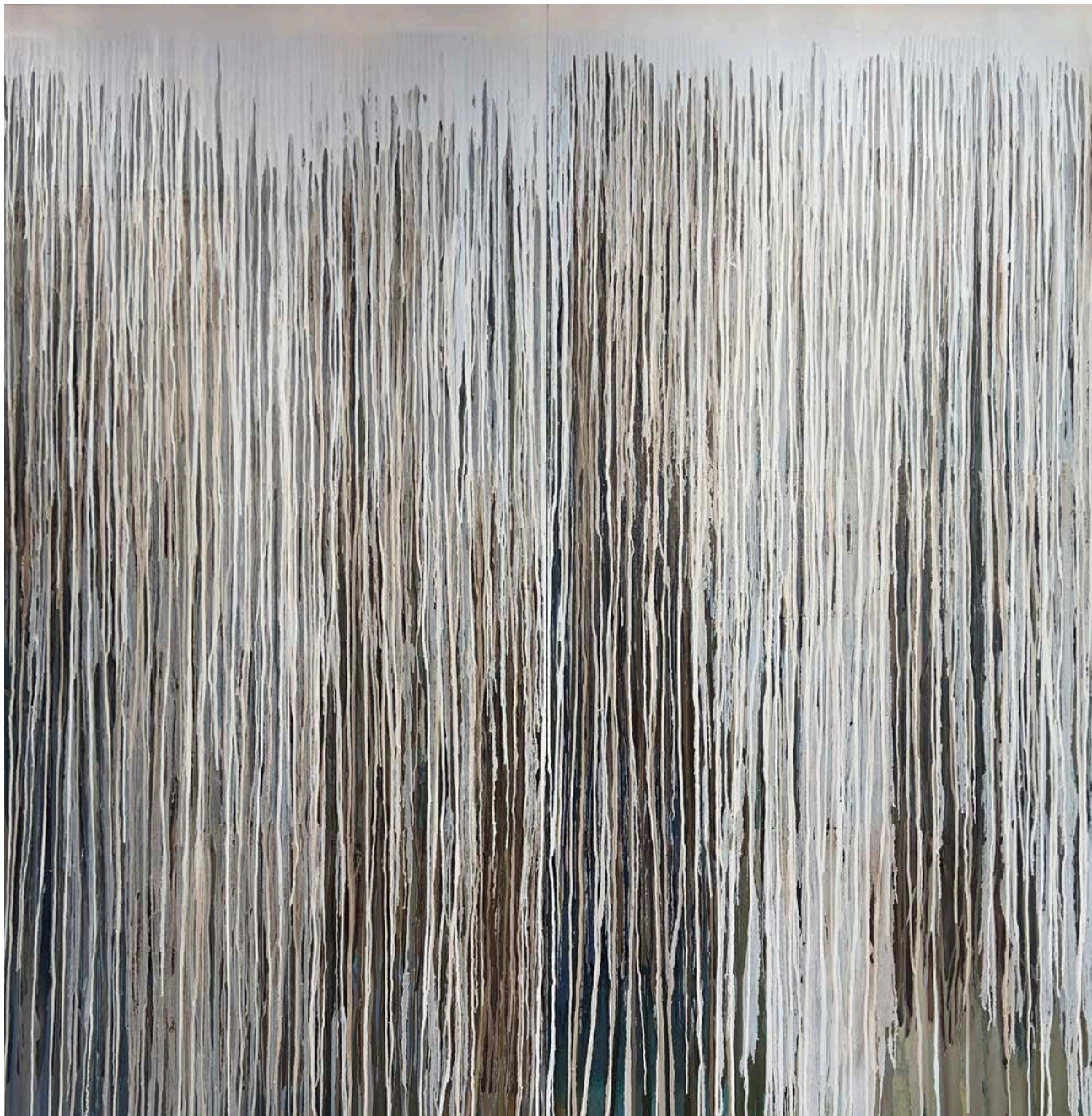
Dissolve 3, 2024 oil on wooden panel 182 x 182cm