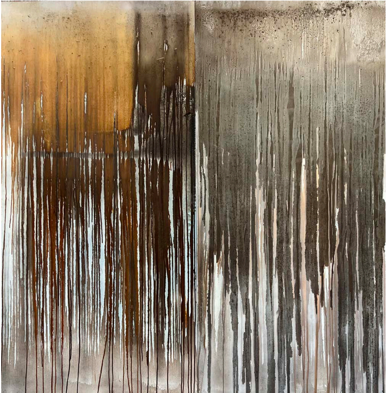
Dissolve 1, 2024 oil on wooden panel 182 x 182cm