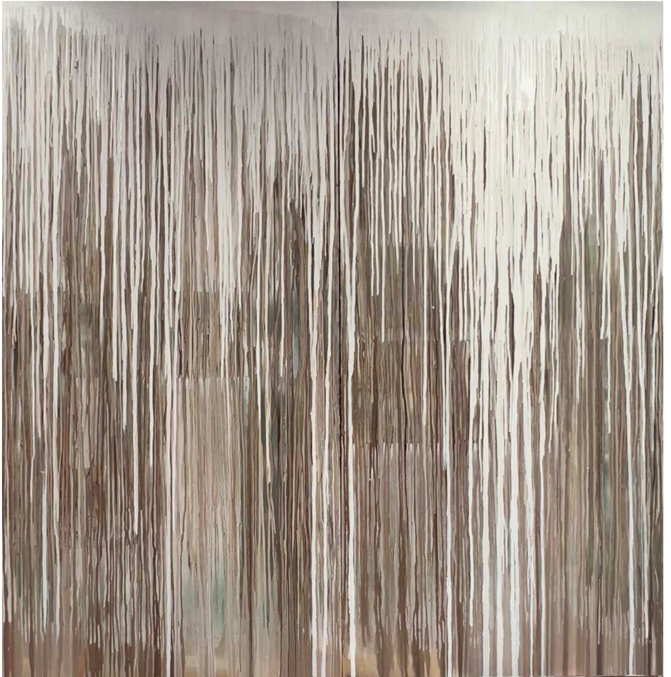
Dissolve 2, 2024 oil on wooden panel 182 x 182cm