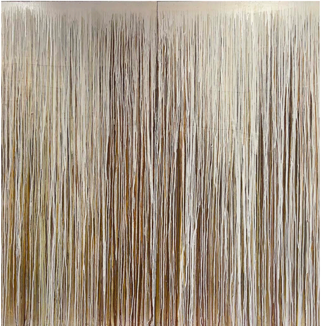
Dissolve 5, 2024 oil on wooden panel 182 x 182cm