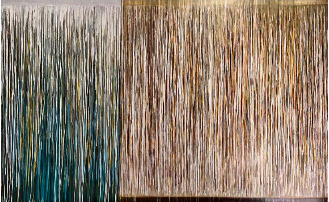
Natural Dissolve, 2024