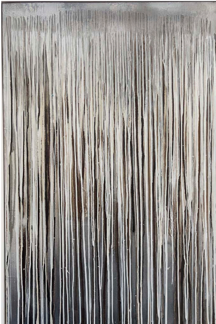
Dissolve B, 2024