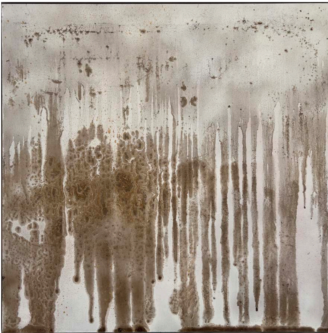
Liquid reACTION 3, 2024