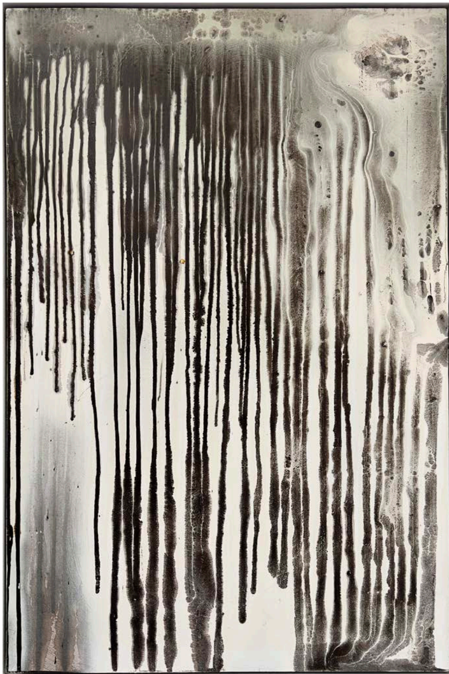
Dissolve A, 2024 oil on wooden panel 126 x 84cm